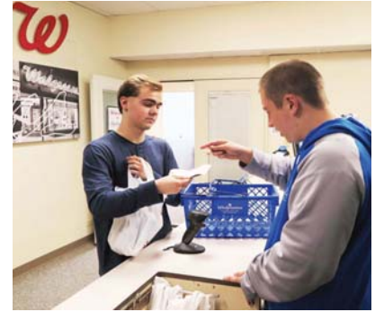
Career Launch interns learning how to work the cash register at Have Dreams' Walgreens Retail Training Center in Evanston

Three years ago, a unique set of doors opened up new opportunities for young adults with autism. The Walgreens Retail Training Center, a micro-Walgreens inside the Have Dreams Evanston location, opened its doors for training young adults with autism how to set up displays, work the cash register, stock and organize shelves, and other critical retail skills.