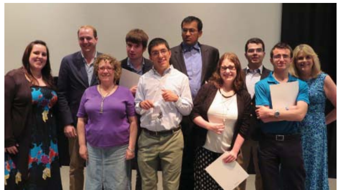
Project SEARCH staff and class of 2016 program graduates

Learn more about the 2016 Project SEARCH graduating class and how to register for the program here: http://havedreams.org/young-adult/#psca or contact Sara LaMontagne at slamontagne@havedreams.org or 847.905.0702, extension 223 .