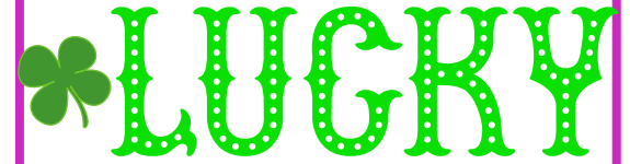
Lucky by: Jason Mraz