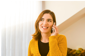
I Just Called by: Stevie Wonder