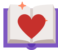
Love Story by: Taylor Swift