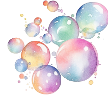
Bubbly by: Colbie Caillat