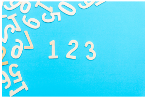
Count On Me by: Bruno Mars