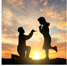
Marry Me by: Train