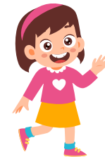
My Girl by: The Temptations